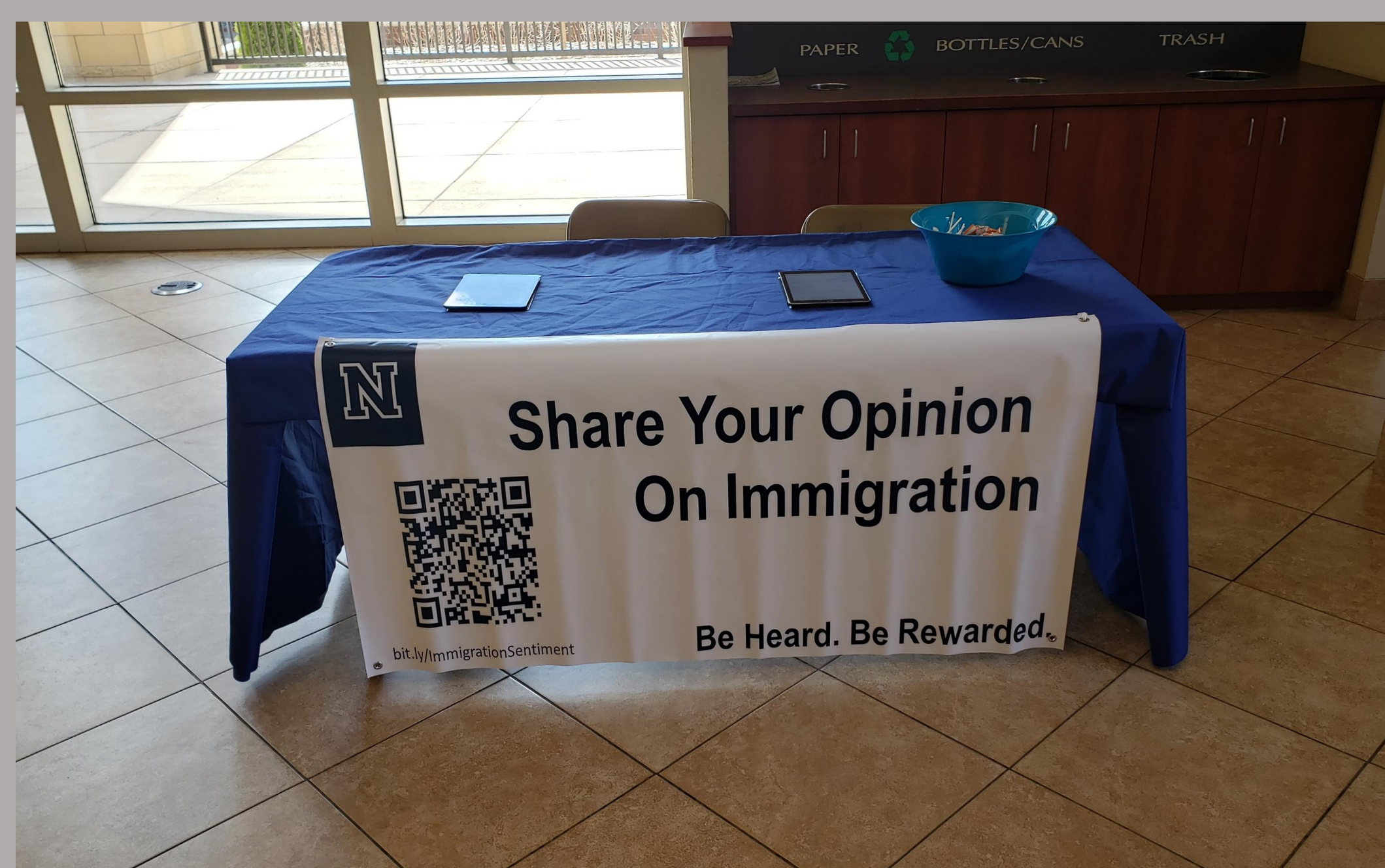
Figure 1: Tabling setup used to distribute survey at student hubs