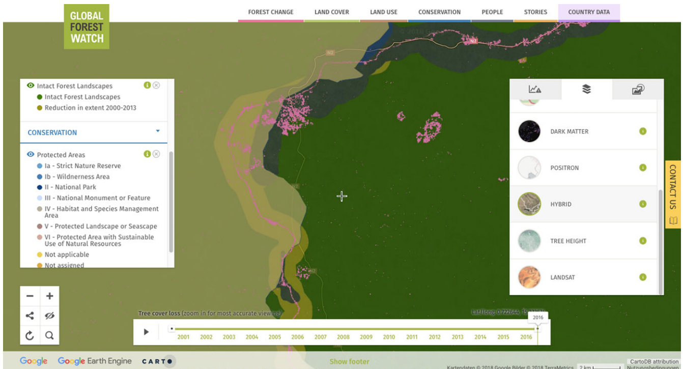
FIGURE 2 Screen-capture of Global Forest Watch in a region of the Republic of Congo with “GLAD Alerts” and “Preservation Areas” layers turned on; notice the incommensurability where deforestation (pale dots) is reported inside the boundaries of the Preserve (dark polygons).

Global Forest Watch retains some of the features of zoom-tool visualizations that we have identified as rhetorically and politically problematic: namely, it presents the move from global to local smoothly, as a synecdochic process of focusing a lens rather than a series of metaphorical comparisons among images of various qualities, sources, and time-stamps. It also imposes algorithms for remote-sensing forest coverage that at times disagree with local histories and even naked-eye observations of new plantations (Müller, 2017).