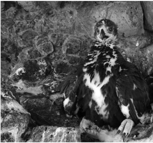
Figure 2. Photograph of a 51-d-old Golden Eagle nestling, first observed within 1 d of hatching. See also Plate 12 in Driscoll (2010) for an image of a 7.5-wk-old eaglet.

Postupalsky (1974) defined a productive or successful nest as one from which at least one young fledged, or if actual fledging was not observed, one in which at least one young was raised to an advanced stage of development (i.e., near fledging age). Ideally, this advanced stage of development should be defined consistently within a species to allow valid comparisons among studies. It would be misleading to compare results from a study that considered nests with downy young to be successful (e.g., Moss et al. 2012) to one that classified nests as successful only if and when young actually fly from the nest on their own volition (e.g., Beecham 1970).