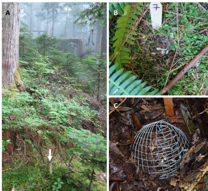
Fig. 1. Photos illustrating depot setup at field sites. Depots were not overly visible from >1 m away (A; arrow), as care was taken not to disturb litter and vegetation around depots (B). Invertebrate seed predation was assessed by excluding vertebrates from some sunflower seed depots using wire mesh cages (C). Photos are from 49°N in Canada at 880 meters above sea level (masl) (A) and 80 masl (B) and from 5°N in Colombia at 2120 masl (C).

Both categorical differences among biomes and continuous environmental gradients contributed to gradients in seed predation. Even after accounting for elevation and latitude, seeds above treeline experienced the lowest total predation (Fig. 2C) and invertebrate predation (Table 1, model 4). When we restricted our analyses to forests, the biome for which we have the best geographic coverage (72% of our sites; Fig. 2A), gradients in seed predation were shallower (Fig. 2, E and G), confirming that differences among biomes contribute to latitudinal and elevational patterns. However, significant latitudinal and elevational gradients existed within forests for both total and invertebrate seed predation (Fig. 2, E and G), with particularly strong effects of elevation at high latitudes (significant latitude × elevation interactions; Table 1, model 5). Persistent gradients in interaction intensity within forests demonstrate that lower alpine and tundra seed predation cannot fully explain latitudinal and